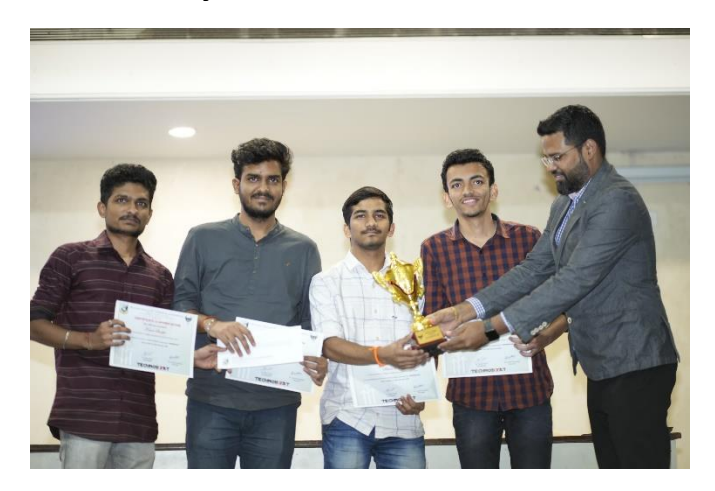
3<sup>rd</sup> Prize: Byte-me