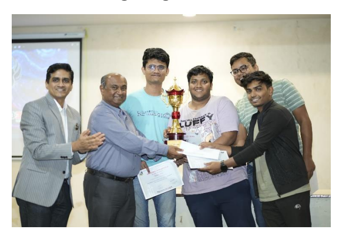
2<sup>nd</sup> Prize: Byte Coders